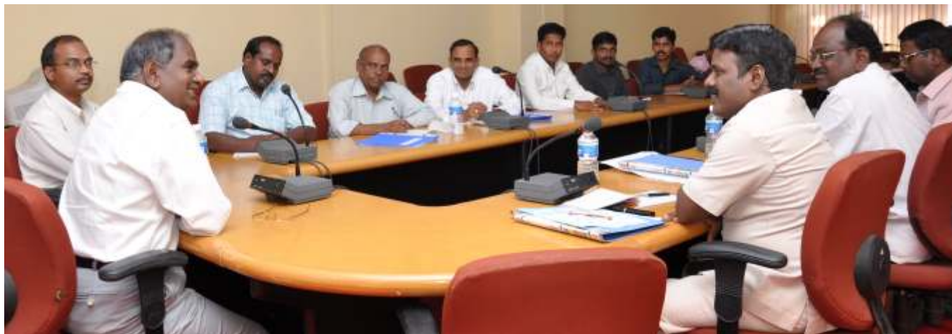
Head, NTS-India addressing the representatives of the identified RFUs

A two day Introductory Meeting for the representatives of the institutions identified for establishing RFUs of NTS was conducted at the NTS H. Qrs., CIIL, Mysore. Representatives from 4 regions of the Tamil speaking area participated in the programme. The main objective of the meeting was to give a briefing about the activities (both academic & administrative) to be undertaken by the RFUs.