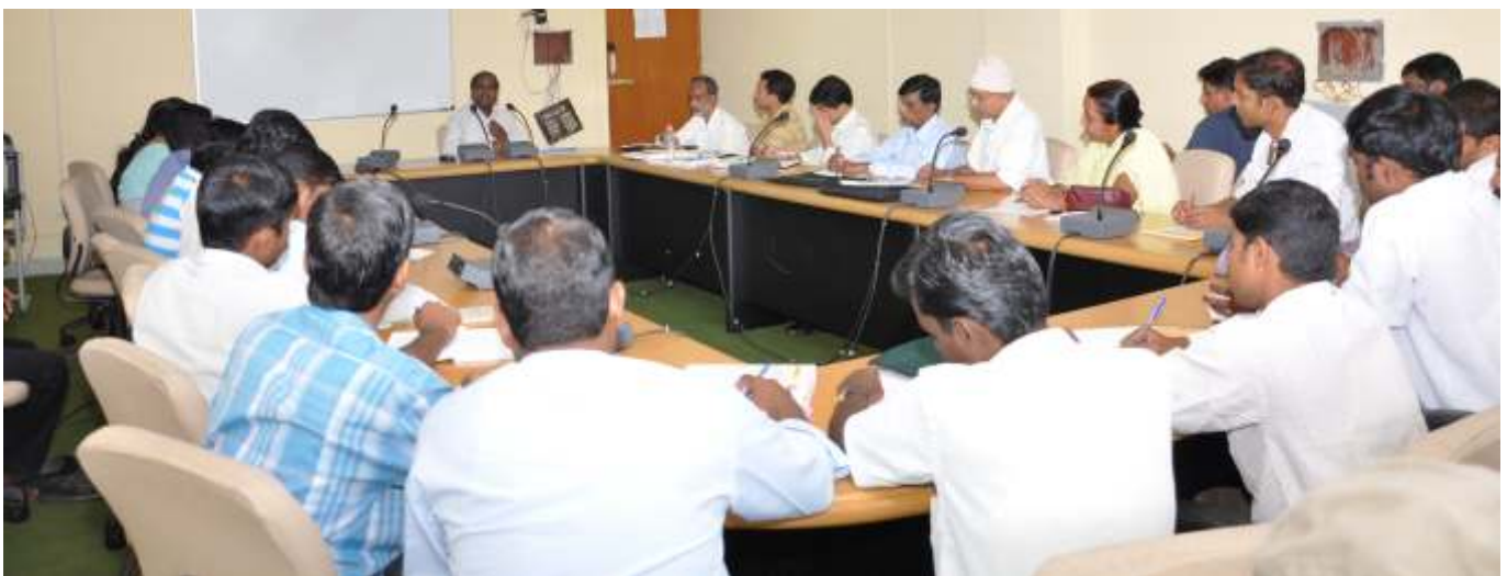
Head, NTS addressing the participants

NTS-India has invited young scholars from different parts of the country to participate in a Short Term Project initially for a duration of about three months starting from 26 th October 2009. Their area of specializations are in Linguistics, Literature, Education, Psychology, Statistics, Management, etc. The purpose of the program was to give them on-the-job-training and to make use of their services for item writing at a later stage. The ultimate purpose is to enrich the database of question items. In the beginning, they were provided with all the background information covering various concepts of testing & evaluation. Special lectures by the academic and technical staff of NTS were also arranged for them on a range of topics related to this area.