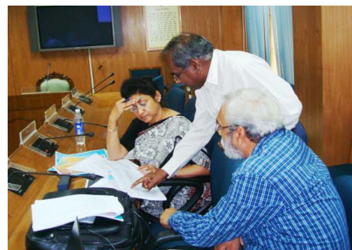
The Head, NTS clarifying the queries to JS(L) and Director i/c, CIIL looks on.