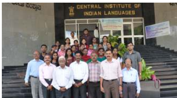
Malaysian Students with Head, NTS-I

A batch of 20 students studying Linguistics in the University of Malaya, Kuala Lumpur, Malaysia visited Central Institute of Indian Languages (CIIL), Mysore on 21st and 22nd July 2013. A team of Professors from Bharathiar University accompanied them.