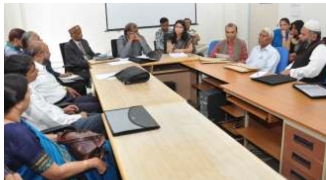
A view of technical session in the Conference at DU, Delhi