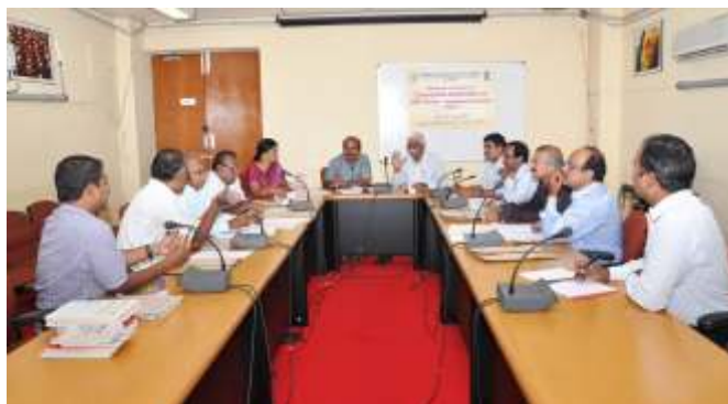
A view of workshop of Conceptual Explanation of Tamil

In this workshop, the accuracy and appropriacy of the technical terms decided, language used in explanations, consistency in the usage of terminology across levels and the overall readability of the explanations were scrutinized. Besides, the experts provided model question items for testing each of the terms explained. The General Frame of Reference comprises approximately 700 terms in the areas of Language, Literature and Personality.