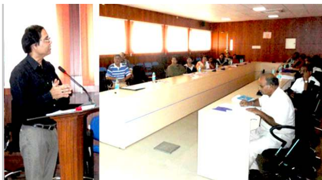
Workshop at SJCE

NTS-I provided the designing of the course and deputed resource persons to give lectures on various topics related to the theme of the workshop. The objective behind organising the workshop was to provide orientation to the fresh faculty members of SJCE on the procedures to be followed in the educational evaluation so that the faculty of the technical courses can assess the achievement & performance. A total of 55 participants comprised of Professors, Associate / Assistant Professors of the SJCE participated in this programme.