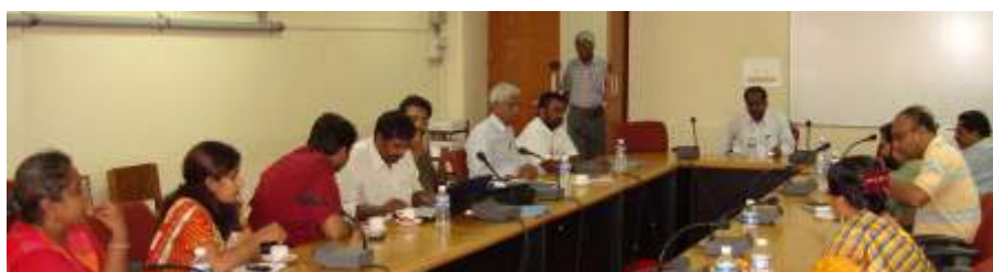
Academic experts and documentary film producers on discussion