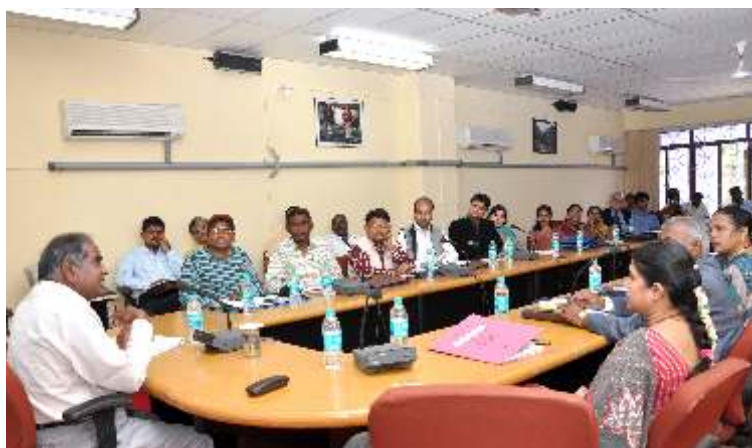
The Head, NTS interacting with the RFU representatives

This two-day interactive meeting was organized at NTS, H.Qrs., CIIL, Mysore to discuss the GIA proposals submitted by the institutions housing Regional Field Units of NTS. Altogether 40 participants representing the RFUs located at Srinagar (J&K), Shimla & Kangra (HP), Jabalpur (MP), Lucknow (UP), Dehradun (Uttarakhand), Darbhanga (Bihar), Hubli (KA), Chennai & Salem (TN), and Puducherry participated in this programme. Majority of the topics proposed by them were on item writing in Hindi, Tamil and Urdu. Some of the topics were based on educational objectives, evaluation techniques, testing methods, etc.